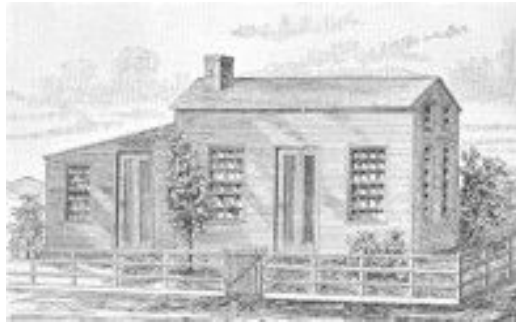
The Fox House – The Origin Of Spiritualism

The age of modern ghost hunting can be said to have begun in the early 1848 when Katie, Margaret and Leah Fox, a trio of sisters, claimed to be able to talk with spirits residing in their home. Using a series of taps and clicking sounds, they appeared to be able to communicate, however rudimentary, with unseen entities in their bedroom. As word got out, people began to flock to the home and to investigate. Unwittingly, these were the first ghost hunters.