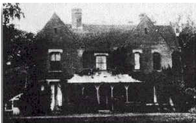
The Borley Rectory

Harry Price's crowning achievement was the Borley Rectory. During the course of a decade, Price conducted a series of investigations at the run down structure in England. The location was the reported sightings of ghostly monks, phantom horses and coaches, and spectral nuns, even though no evidence of a monastery has ever been discovered on the grounds. When poltergeist activities began to occur to the owners, both skeptics of the paranormal, in 1928, Price was called in. At the time, Price was the founder and director of the National Laboratory of Psychical Research in London. During the course of the investigations led by Harry Price, many were convinced that something of a paranormal nature was taking place at the Rectory.