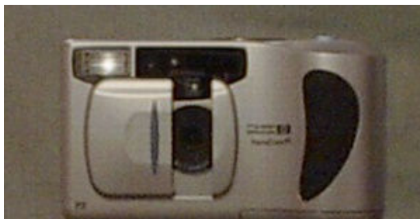
A Digital Camera

The problem with digital cameras arrives from the processor inside the camera. All digital cameras, by their very nature, have computers within them that translate the image coming through the lens into a digital format. It is during that translation that problems can and do occur. Usually this happens when pictures are being taken in a dark area and the darkness becomes hard for the processor to translate. So, the result is anomalies in the digital images that closely resemble orbs. They are not ghosts as many would claim but defects in the images.