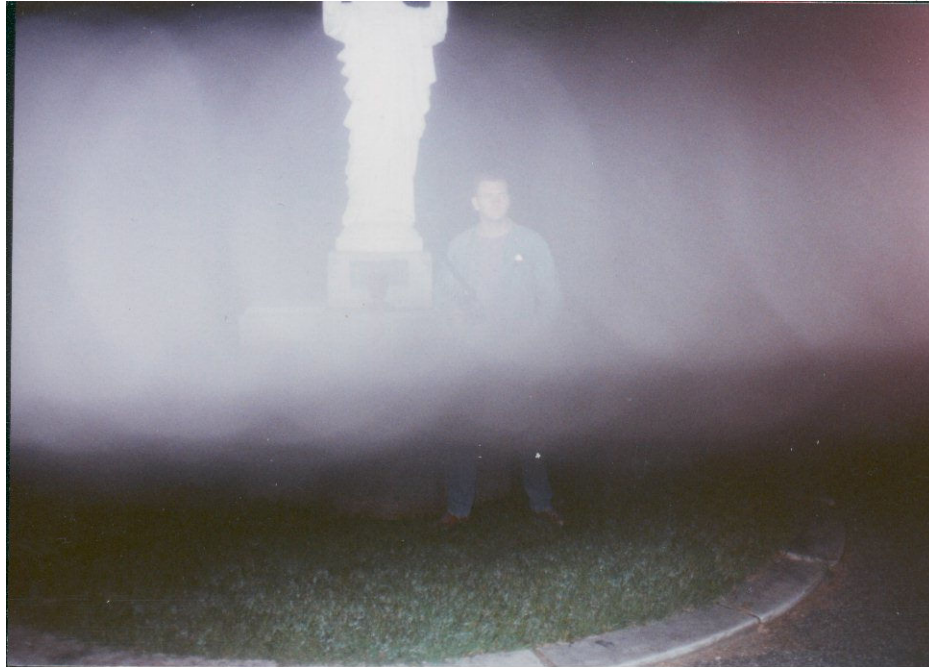
An Anomalous Photograph Taken At Amendale Institute Circa 1990

Amendale Institute, Beltsville, Maryland