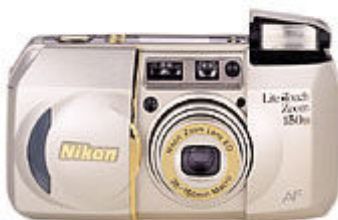
A 35 MM Camera

Of course, the advantages of the digital camera are the weaknesses of the 35 mm. However, with the 35 mm, you have a negative that can be analyzed and it is far harder to manipulate an image on 35 mm film.